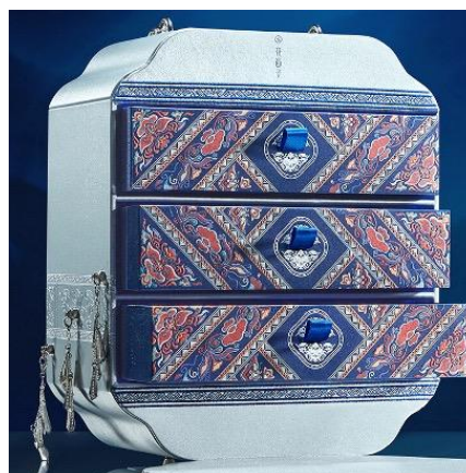
Fig. 9. Hua Xizi Cosmetic box packaging design [16]