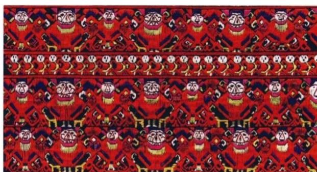
Fig. 3. Multi-segmented patterns repeated composition of continuous type [14]