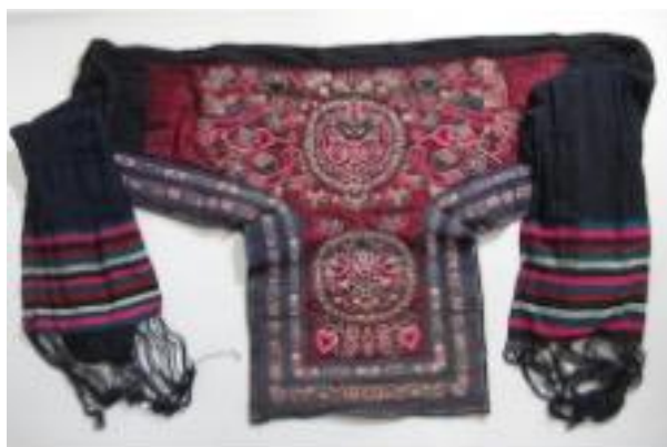
Fig. 7. Qiandongnan Miao Embroidery Strap [14]