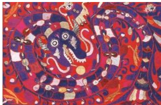
Fig. 6. Hmong embroidery "dragon pattern" [14]

emotional expression and exploration of the spiritual realm. Using bold colors, exaggerated forms, and rhythmic lines, it constructs an art world that is both real and fantastical. This approach, which transcends figurative representation and integrates subjective emotions, shares similarities with the Cubist movement in Western modern art that seeks to break boundaries and innovate (Fig. 8).