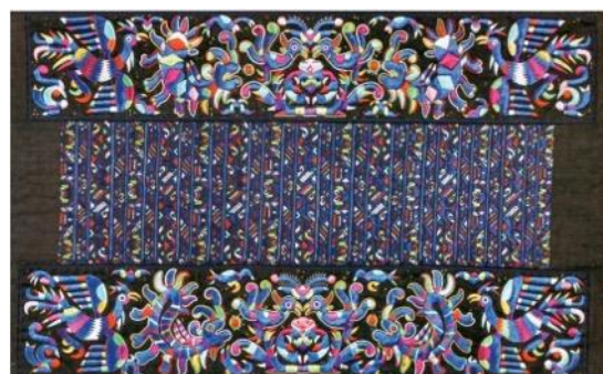
Fig. 4. Splicing and Continuous combination of multiple composite type [14]