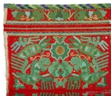
Fig. 2. Patterns segmented composition of splicing type [14]