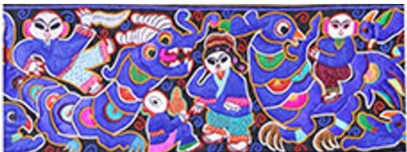
Fig. 1. Miao Embroidery "Bull Head with Dragon Body" Pattern [14]