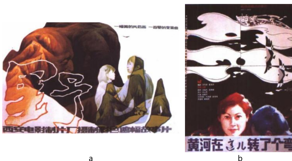
Fig. 6. Examples of the mainland China release poster of Xi'an Film Studio: a – "Wild Mountains", 1986; b – "The Yellow River Turns Here", 1986