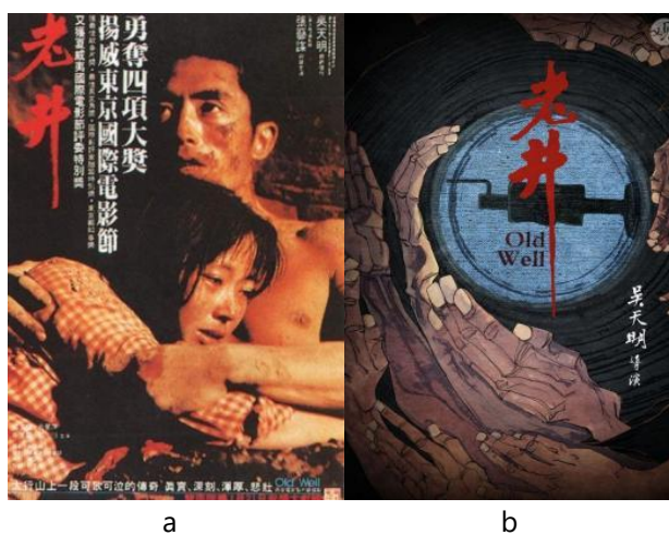
Fig. 2. Examples of Xi'an Film Studio film "Lao Jing" series poster: