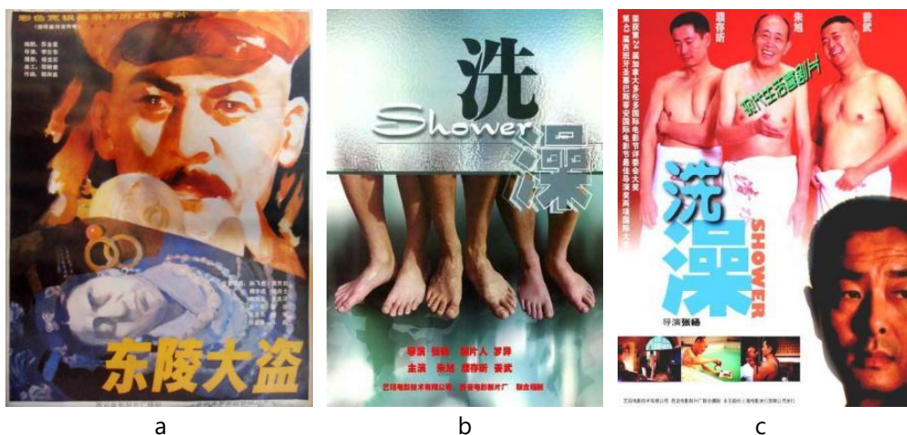
Fig. 4. Examples of Xi'an Film Studio film "Eastern Tomb Robber" and "Shower" series poster: