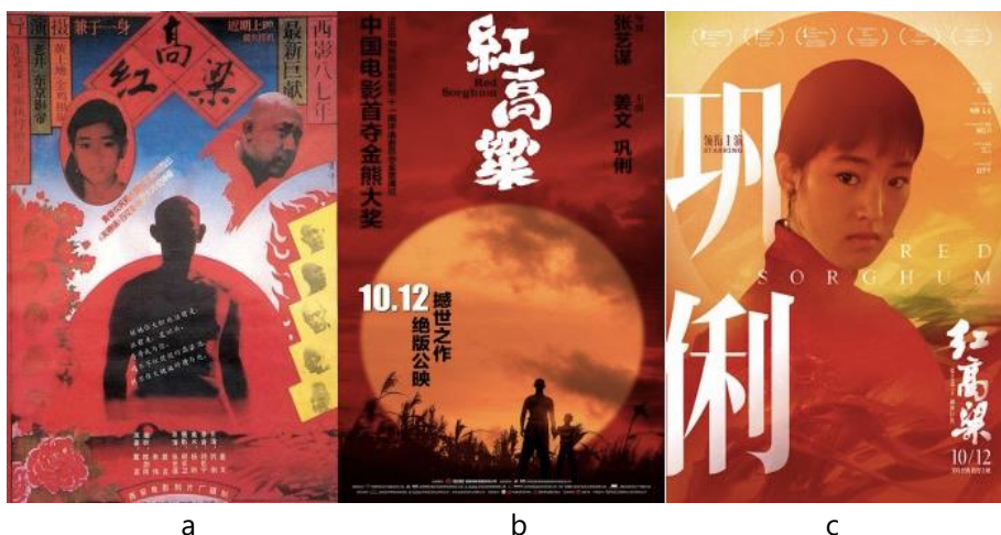
Fig. 1. Examples of Xi'an Film Studio film "Red Sorghum" series poster: