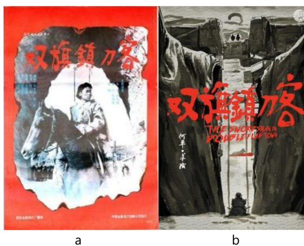
Fig. 3. Examples of Xi'an Film Studio film "Swordsmen in Double Flag Town" series poster: