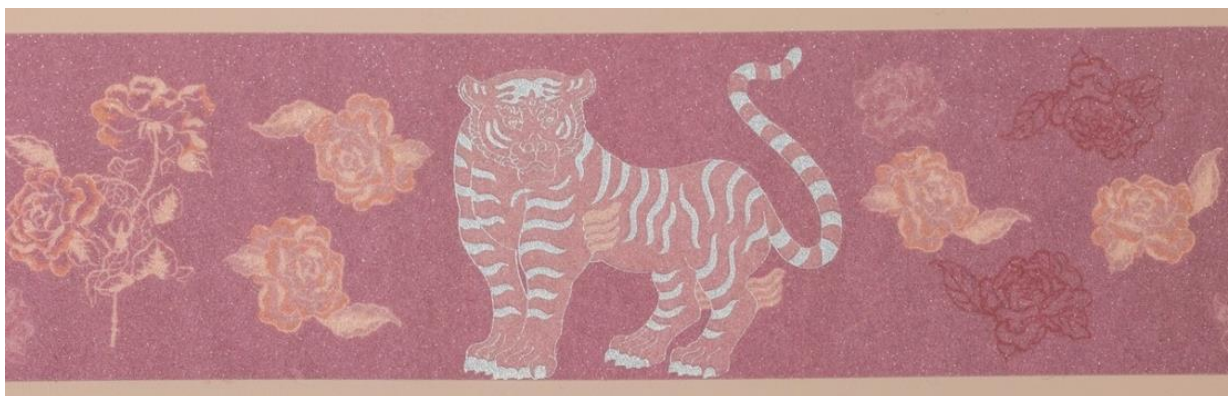
Fig.8. A tiger pattern from the «Tiger Sniffs the Rose» collection by Chen Liwen. China, 2022 [18]