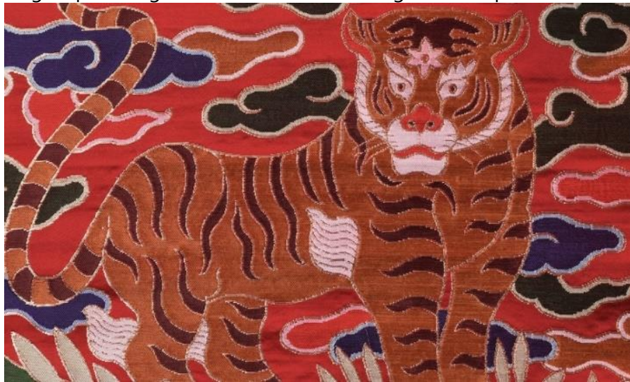
Fig.7. Ming Dynasty Hu Bu brocade pattern [18]

successively entered the Western Regions, and their pattern culture gradually became one of the origins of the pattern art of the Silk Road.