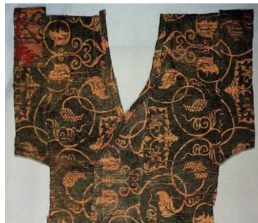
Fig. 4. Greenland Grape Tang Grass Pattern Half-arm Tang. China Silk Museum [22]