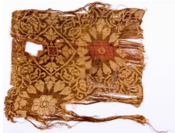
Fig.2. Brown and round pattern brocade Tang Dynasty. China Silk Museum [2]