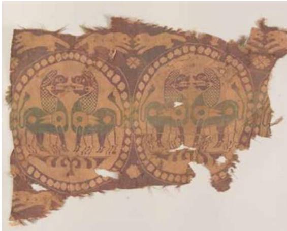
Fig.1. Tang Dynasty brocade with a pattern of interlocking beads and lions. Collection of Lianzhu on Lion Pattern Brocade. China Silk Museum [22]

plastic arts and is one of the most common traditional composition forms.