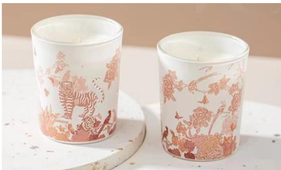
Fig.9. Candles from the «Tiger Sniffs the Rose» collection Photo: Chen Liwen [18]