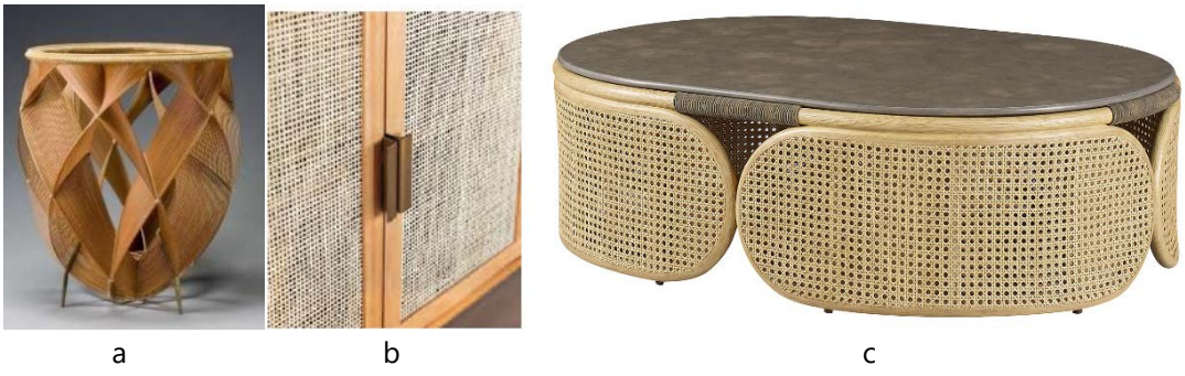
Fig. 1. The visual expression of bamboo weaving in furniture design: a – "Shimmering of heated air", Shono Shounsai, Tokyo, Japan,1969 [27]; b – "Sorren Media Cabinet", Shea & Syd McGee, Utah, USA, 2014 [28]; c – "Loop Cocktail Table", Jamie Durie, Australia, 2019 [29]

modern bamboo woven products. The optimization and deconstruction of bamboo weaving offer novel opportunities for furniture design. A range of weaving methods are utilized in furniture, with the resulting components being reassembled in unique combinations. Alternatively, fine bamboo weaving techniques can be modularly spliced and interwoven to create a dynamic and integrated curved space, as seen in Fig. 4, c–d [35]. These design strategies inspire creative approaches to expanding the traditional bamboo weaving process.