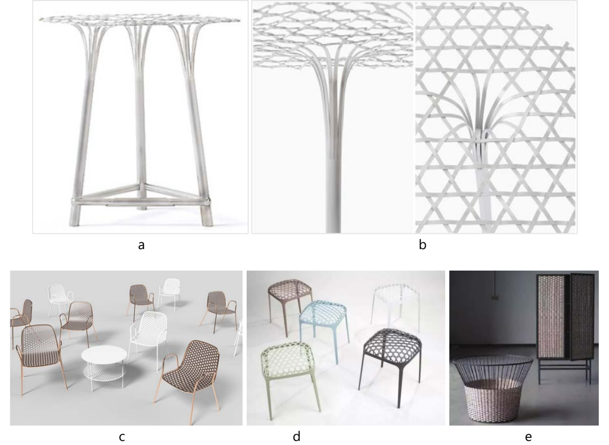
Fig. 4. The way of bamboo weaving combined with new technology into modern furniture design: a–b – "Bamboo Steel Table", Masayuki Hayashi, Japan, 2012 [34]; c–d – "Sunyata chair", Zhang J. J, Taiwan, China, 2015 [35]; e – "Meet the wicker basket", Nils Chudy & Jasmina Grase, Germany, 2017 [36]

Bamboo upholstery panel furniture represents a novel form of bamboo upholstery and modern furniture, achieved through innovative processes that combine bamboo upholstery technology with modern panel furniture production techniques (Fig. 4, e) [36]. This type of furniture is designed to make full use of wood and its scraps, thereby improving wood utilization rates and mitigating issues such as board expansion and deformation, while simultaneously enhancing board quality. The development and design of bamboo decorative panel furniture not only reduces wood resource loss, but also leverages the unique characteristics of bamboo furniture to create a new, environmentally-friendly furniture form that warrants further exploration.