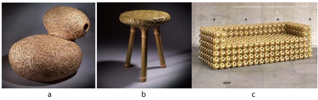
Fig. 3. The approach of bamboo weaving technologies into furniture design: a – "Cocoon plan furniture sofa", Rock W. & Kao M. C., Taiwan, China, 2010 [32]; b – "BAMBOO STOOL", Zhou Y. R. & Su R. R., Taiwan, China, 2011 [33]; c – "PAOPAO SOFA", Zhou Y. R. & Su R. R., Taiwan, China, 2011 [33]