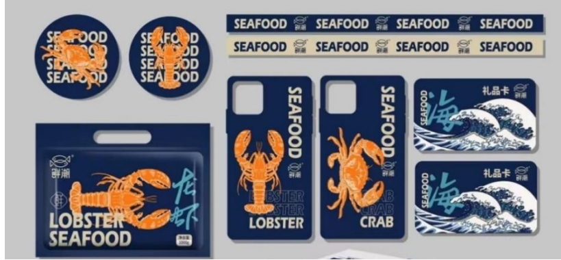
Fig. 3. Seafood Brand "Fresh Tide" in China, 2022: a – brand logo design; b – brand application [11]