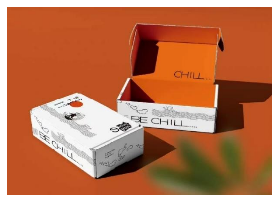
Fig. 9. Homestay "Qianju" brand design (Taiwan, China)

A marine-themed logo motif allows for greater flexibility in expressing the brand's philosophy, while later extended use can also bring more enjoyment to the brand.