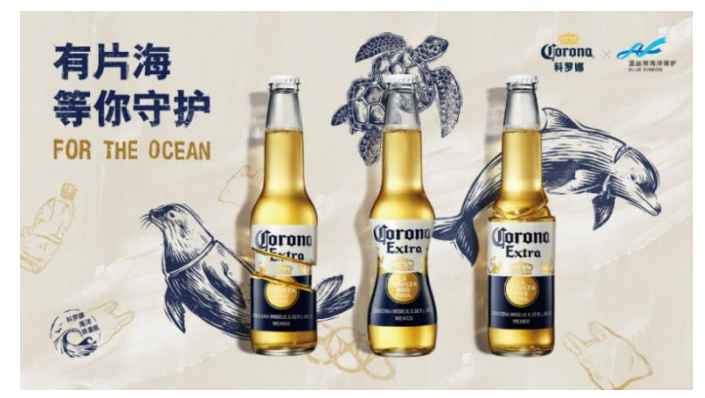
Fig. 4. Brand identity "Calgee", 2020, USA [12] Fig. 5. Corona marine special-shaped bottle series. German artist Ella Ginn, 2021, China [13]