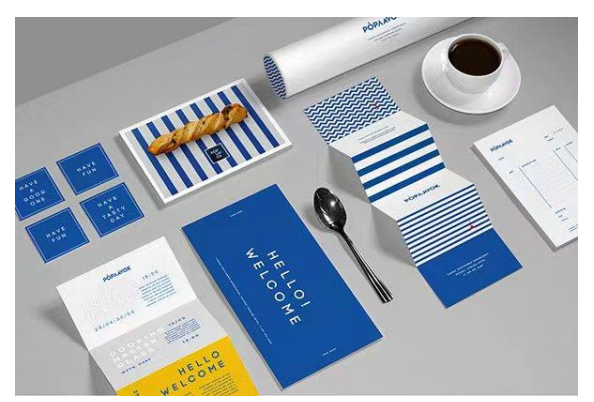
Fig. 8. Brand design of the restaurant "Poplavok" (Yerevan, Georgia)

The design uses the image of seafood as a unique brand concept, as the basis, a visual image full of positivity, with a variety of symbolic patterns, with fresh blue as the main color, allowing consumers to enjoy food in a pleasant atmosphere.