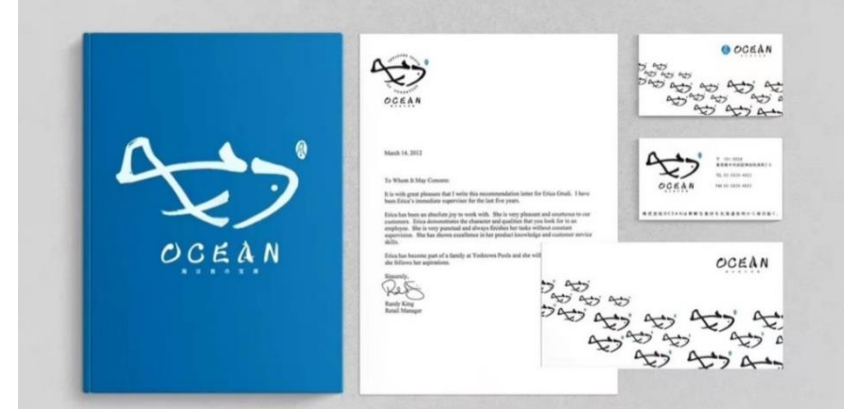
Fig. 7. Japanese restaurant "OCEAN" brand design