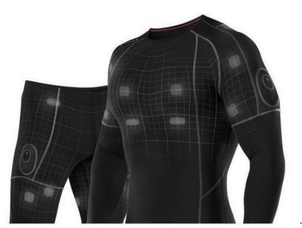
Fig. 1. Smart fitness clothes, Athos, 2012

warm, these strips curl outward, causing the body temperature to drop. On the contrary,