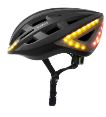
Fig. 5. LUMOS intelligent riding