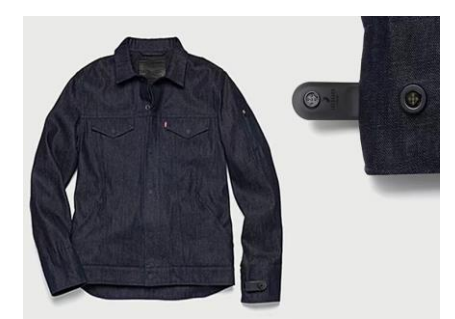
Fig. 3. Commuter Trucker Jacket, Google&Levis, 2015