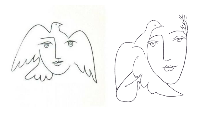
Fig. 7. One line drawing by Pablo Picasso, 1950–1951