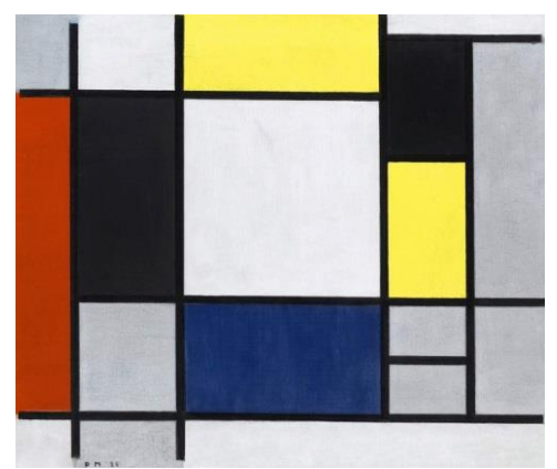
Fig. 1. «Composition with Yellow, Red, Black, Blue and Gray», 1920, by Piet Mondrian