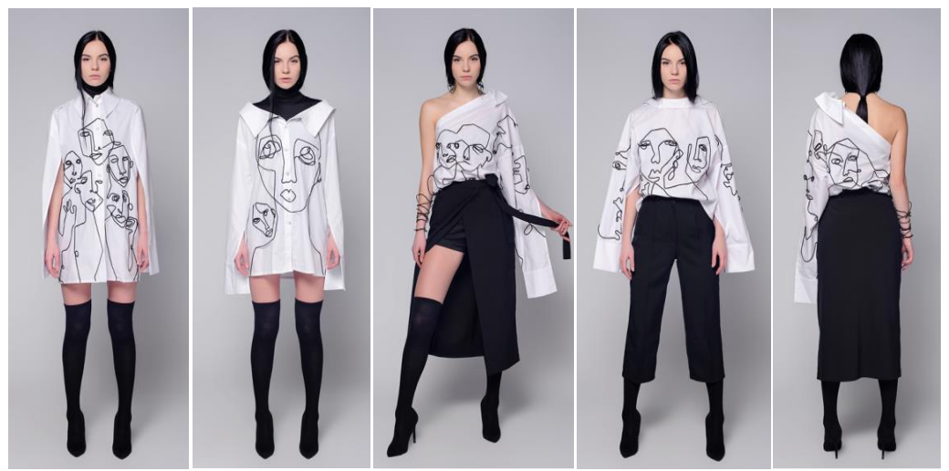
Fig. 11. The collection of women's clothing «Your Face» (author Tia Taips, supervisor Oleksandr Troyan)