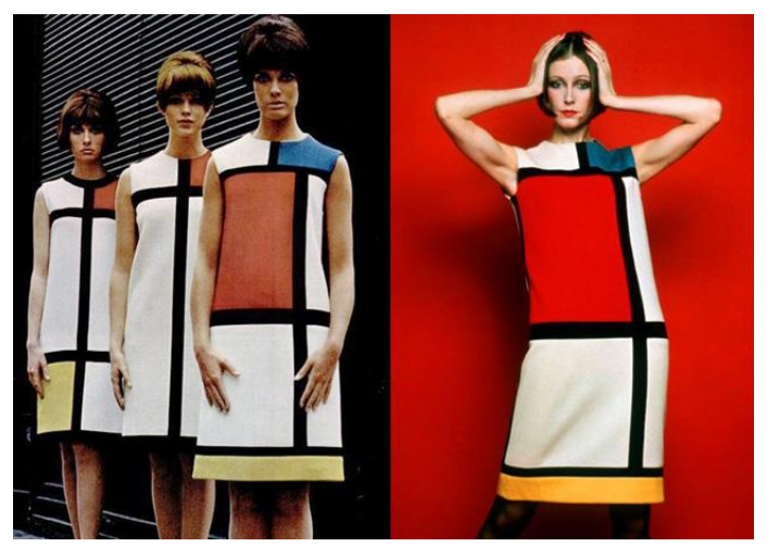
Fig. 3. The models of dresses from Yves Saint Laurent's collection «Mondrian», 1965–1966

Until now Mondrian's creative work remains an inexhaustible source of inspiration for fashion and industrial designers, designers of the interior. The clear geometric lines of Mondrian's paintings ideally lie on any surface and elevate everyday objects to the level of genuine art.