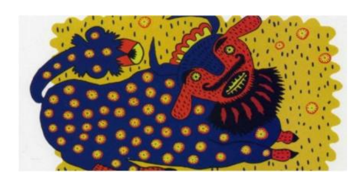
Fig. 5. «The Blue Bull», 1947, by Mariya Prymachenko