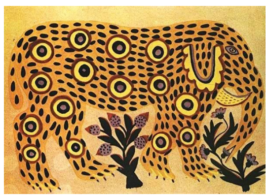
Fig. 4. «The Elephant», 1937, by Mariya Prymachenko