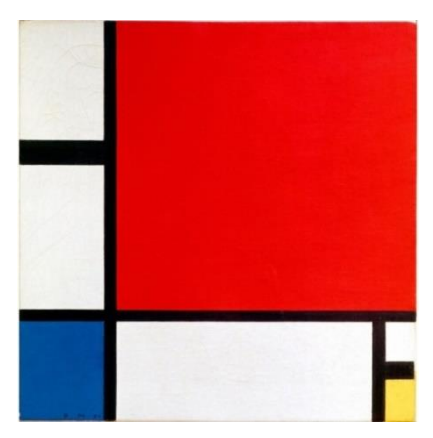
Fig. 2. «Composition II in Red, Blue and Yellow», 1930, by Piet Mondrian