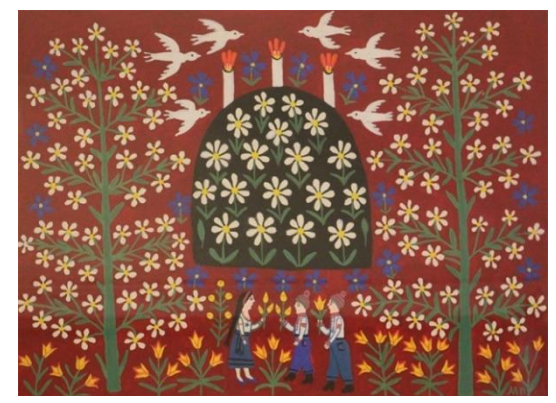
Fig. 6. «The Fourth Power Unit», 1988, by Mariya Prymachenko