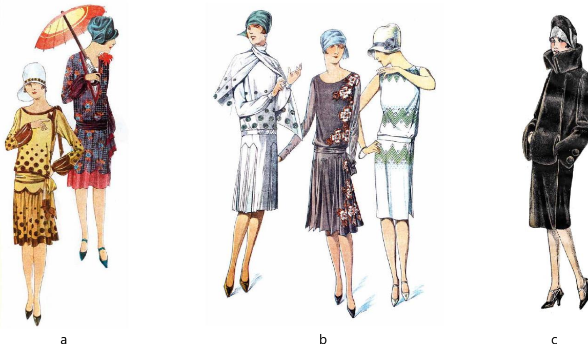
Fig. 2. Models of clothes from "Fashion magazine": a – dresses made of light patterned fabric, 1927; b – light dresses with embroidery and applique, 1927; c – coat made of seal fur, 1929

"Fashion Magazine" had a circulation of up to 18,000 copies and was a kind of textbook for an army of craftswomen who possessed extremely complex "couture"