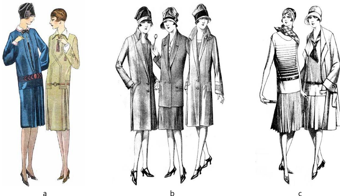
Fig. 2. Models of clothes from "Fashion magazine": a – models of dresses made of fine wool, 1928; b – classic costume and light coats, 1928; c – summer sets in sports style, 1927

models recommended by "Fashion Magazine" show the availability of knitwear for domestic fashionistas (Fig. 2c).